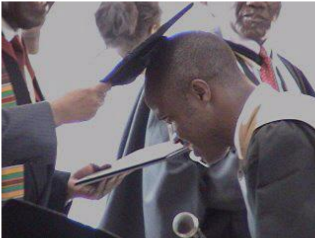
Figure 2 Tshala graduates from Africa University

the fruits of their work. It was a very practical lesson in the lives of those children and those who witnessed it.