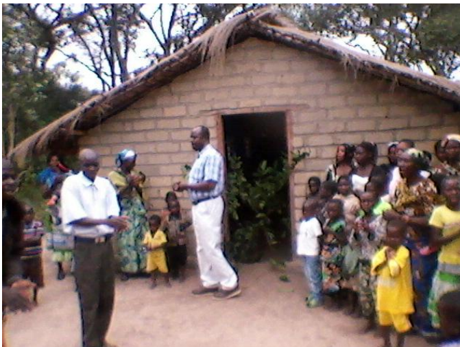
Figure 5 At dedication of new UM Church. The last time I heard Tshala Preach. The topic was "courage to follow Christ".

He was delegate twice, to General Conference and served the Conference in many ways. His shadow was very large over both Zambia and D.R. Congo, having even done trainings in Lodja in Central D.R.Congo.